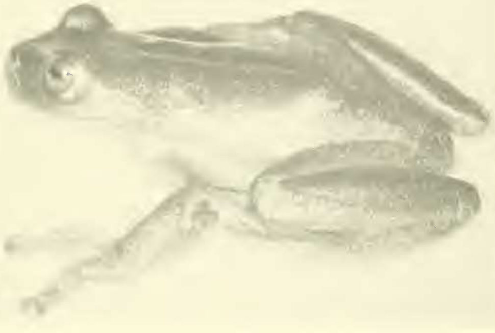
Fig. 1. Holotype of Hyla callipeza , KU 169567, female, 33.0 mm SVL.

distance much greater than width of eyelid; supratympanic fold weak, curved from posterior corner of eye to point above insertion of forelimb, obscuring upper part of tympanum; tympanic annulus barely evident; tympanum separated from eye by a distance slightly greater than diameter of tympanum.